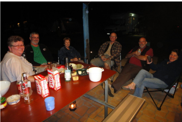
The crew in the BBQ shelter