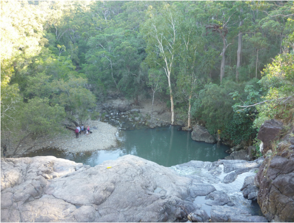
The view from above the falls