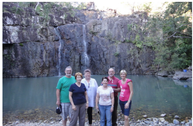
Cedar creek falls during our visit