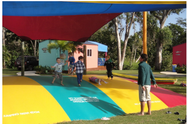
The awesome jumping pillow in use.